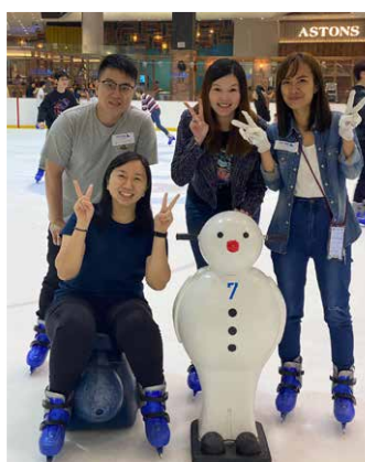
Fun on the ice skating rink