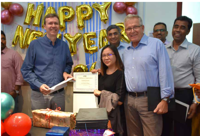
Long service award presentation