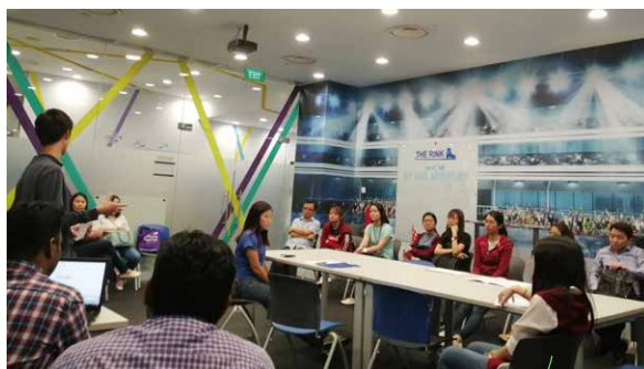
Introducing the new NSL SRC committee

We thank these volunteers for their hard work towards NSL SRC and look forward to more exciting activities!