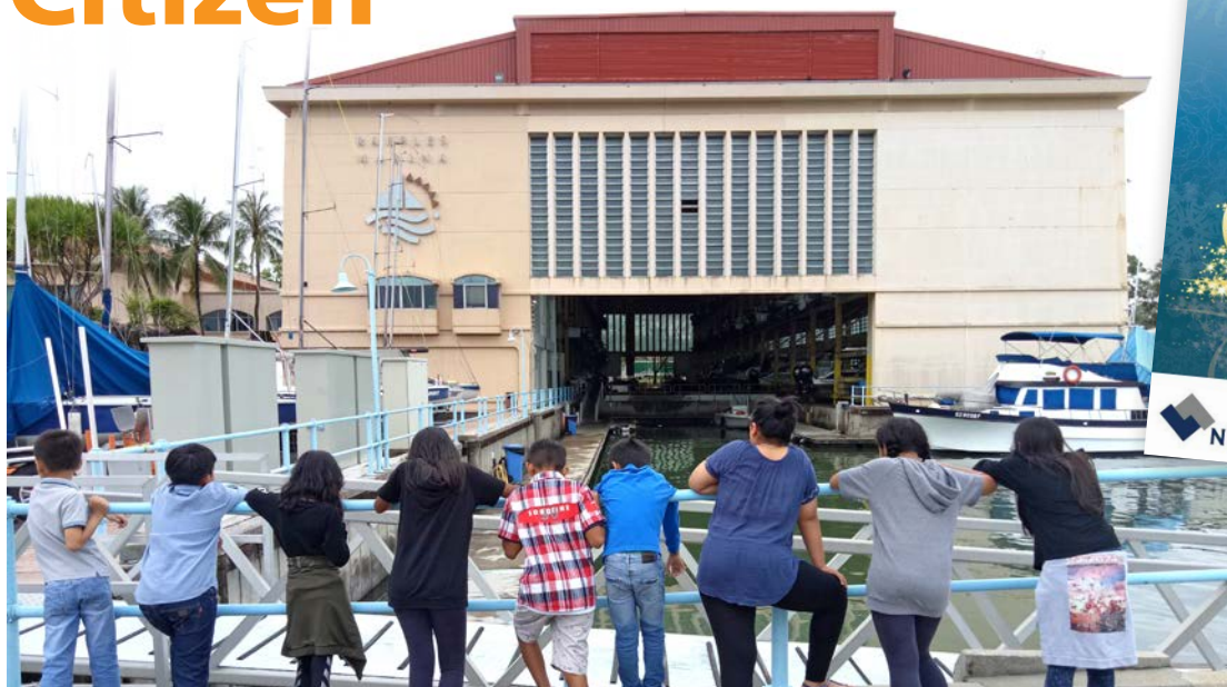
Melrose Home beneficiaries visit Raffles Marina

While achieving business goals are important, NSL believes that we need to make a positive impact on the community, environment and all stakeholders. We will continue to strengthen our sense of stewardship to the community and our future generations.